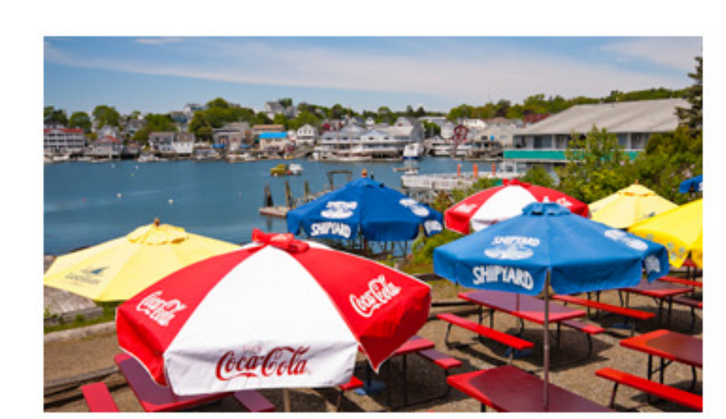
Dummy title below news item