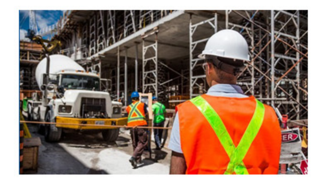
Dummy title below news item