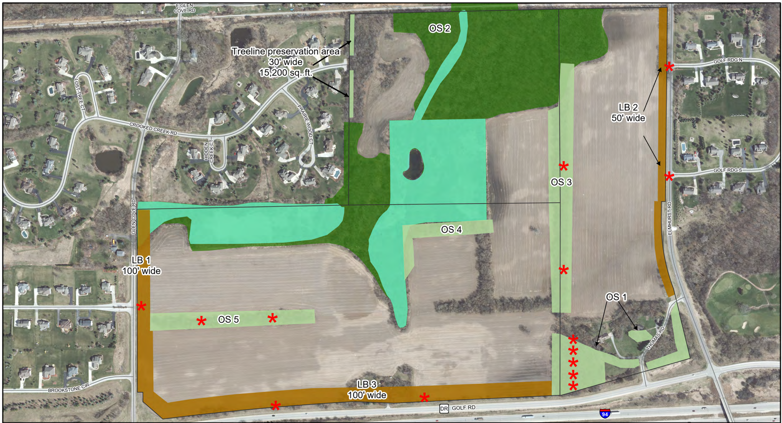
Map 2: Planned Development District No. 1 Open Space Requirements

Wetlands (DNR 2010) Primary Environmental Corridor (PEC) (SEWRPC 2015)